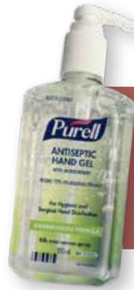
Purell Antiseptic Hand Gel Table Top Pump Bottle 350ml