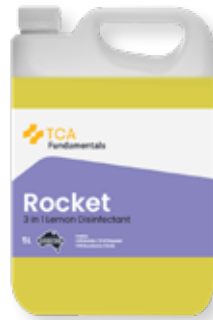
TCA Rocket 3 in 1 Lemon Disinfectant 5L 5L - 5T-ROCKET005