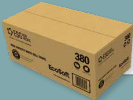
ESG EcoSoft Controlled Use Hand Towel White 6 Rolls x 243m 4-380 - EACH

ESG Asia Pacific delivers high-quality, eco-friendly washroom and hygiene solutions across the region. Their products, from recycled paper towels to smart dispensers, help businesses reduce waste, save costs, and operate more sustainably. With a focus on environmental responsibility and community impact, ESG Asia Pacific makes it easy for organisations to do good while doing business better.