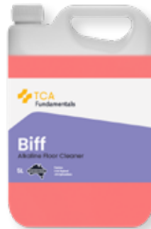
TCA Biff Alkaline Floor Cleaner 5L - 5T-BIFF005