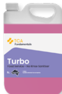
TCA Turbo Food Service No Rinse Sanitiser 5L - 5T-TURBO005