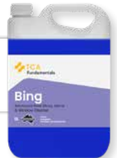
TCA Bing Amonia Free Glass, Mirror And Window Cleaner 5L - 5T-BING005