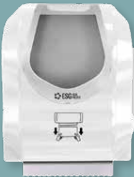
ESG Simplicity Dispenser for Hand Towel Roll White Gloss 4-HD504 - EACH