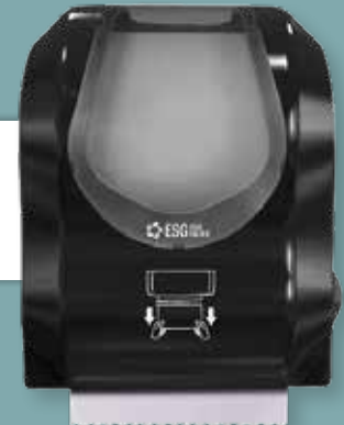
ESG Simplicity Dispenser for Hand Towel Roll Black Gloss 4-HD503 - EACH