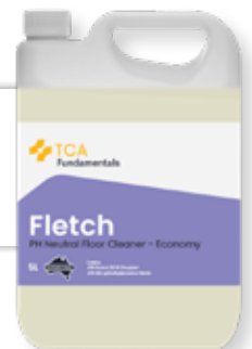
TCA Fletch PH Neutral Floor Cleaner Economy 5L - 5T-FLETCH005